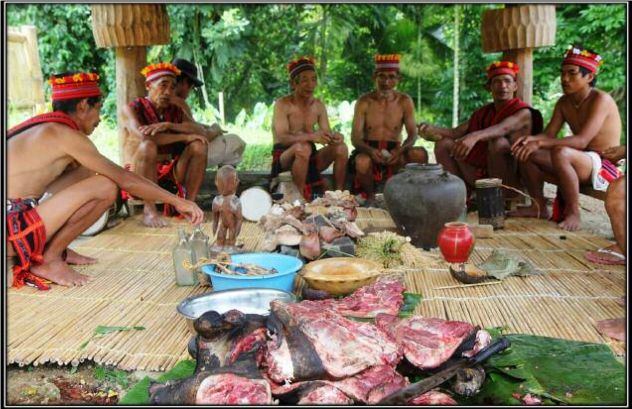
Figure 3. A group Mumbaki (Ifugao religious specialists) performing a ritual.

Things usually get interesting when archaeologists present material evidence apparently lost in the cultural memory of the community. This triggers a surge of recollections that usually work both ways to validate the archaeologists' empirical assumptions and the community's fading reminiscence of a forgotten aspect of their heritage. For the modern Ifugao who stands on the threshold of cultural loss, community archaeology serves as an aid to self-discovery and revitalized ethnic identity. Recent archaeological work has also encouraged the modern Ifugao to reconsider their place in Philippine history making.