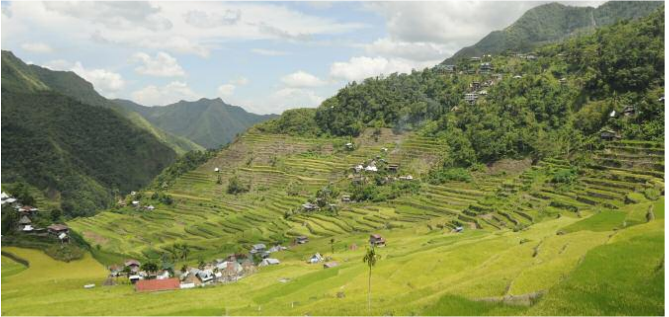
Figure 2. Rice terraces in Battad, Ifugao.

humanize and end the exclusive control that “colonial archaeology” has had over the interpretation of the material past. In the IAP, local stakeholders’ participation intends to serve as a catalyst for renewed community interest in their nearly forgotten past and to encourage them to play a more active role in conserving their heritage.